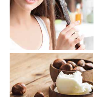
Size: 100ml NTC Code: 4430026